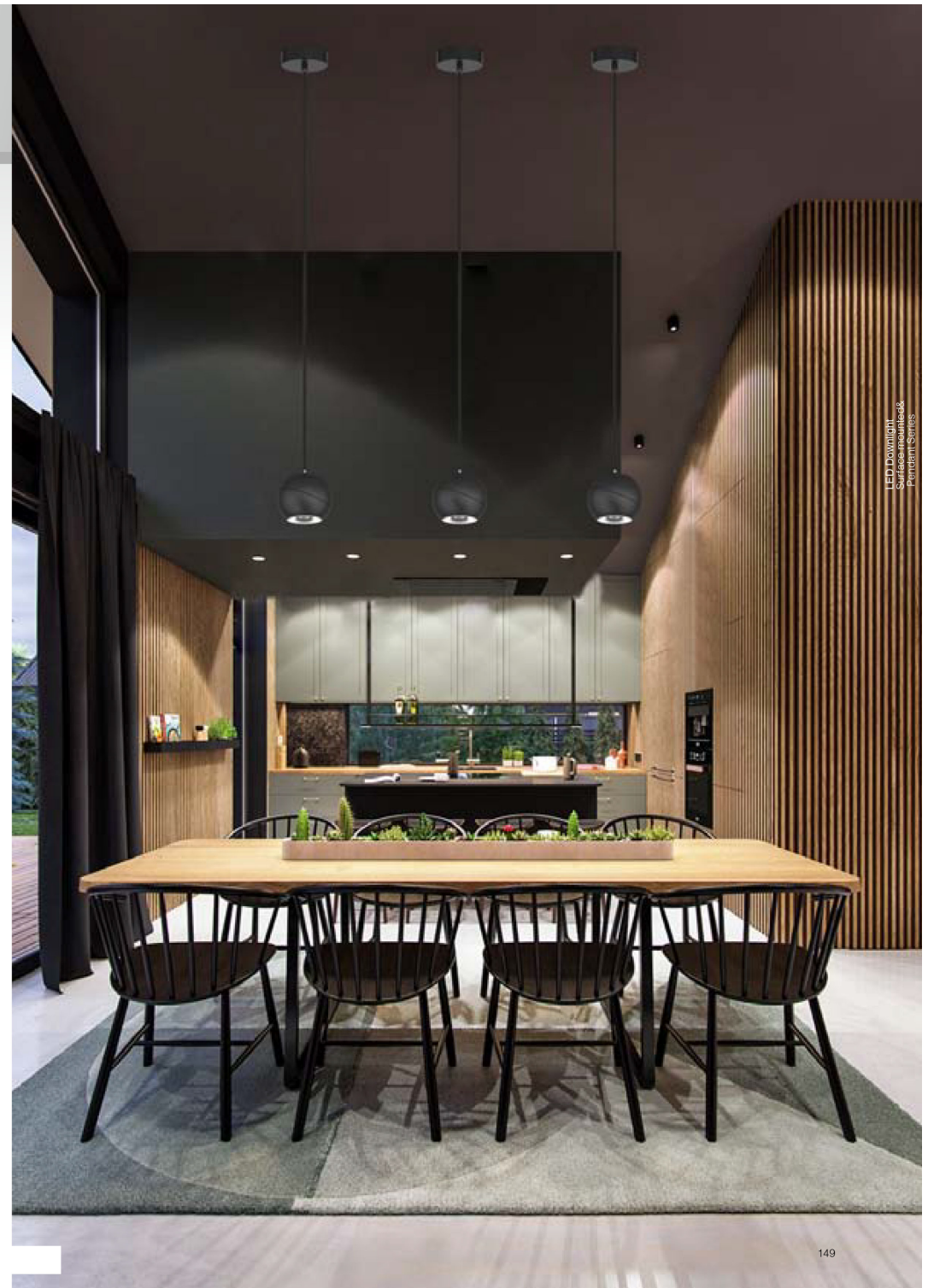
LED Downlight Surface Mounts & Pendant Series